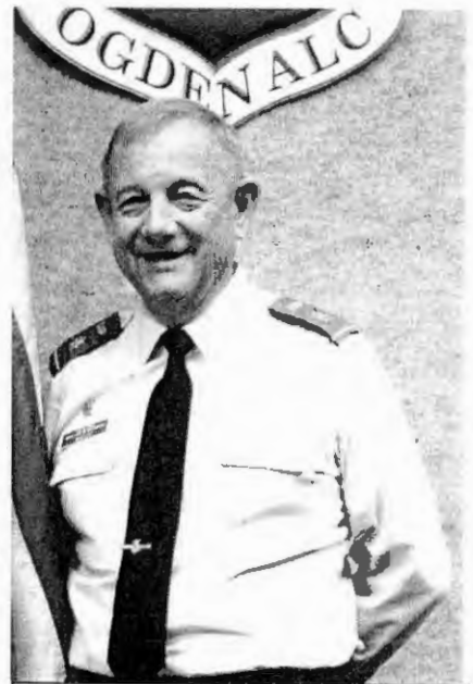
Honorary Cadet for Life